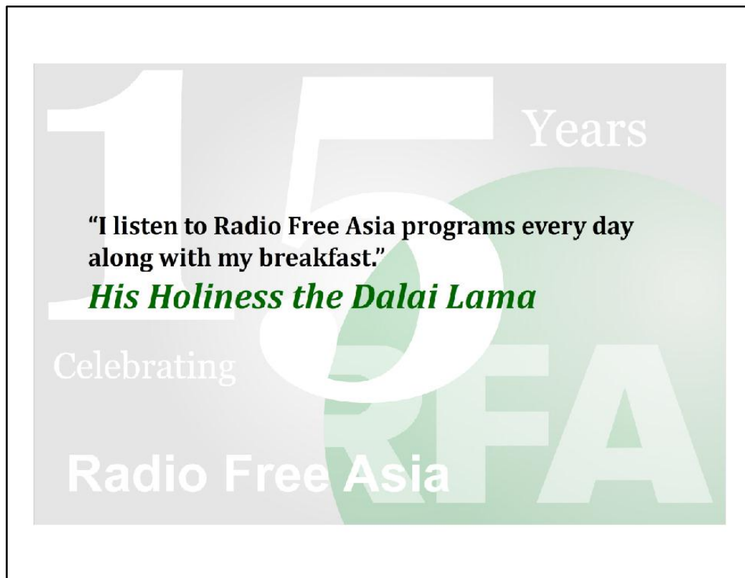
RFA's 39th QSL card commemorating 15 years of broadcasting.

Radio Free Asia (RFA) announces the release of our 39 th QSL card. This is the fourth QSL card commemorating 2011 as RFA's 15 th anniversary. Not only is The Dalai Lama the subject of this card, but The Dalai Lama was also the subject of RFA's very first QSL card. RFA's first broadcast was in Mandarin Chinese on September 29, 1996 at 2100 UTC. Acting as a substitute for indigenous free media, RFA concentrates its coverage on events occurring in and/or affecting the countries to which we broadcast. Those countries are: Burma, Cambodia, Laos, North Korea, Peoples Republic of China, and Vietnam. This QSL card will be used to confirm all valid reception reports for September 2011. Similar designs will be announced monthly between now and the end of the year. To learn more about RFA's anniversary, visit www.rfa15.org .